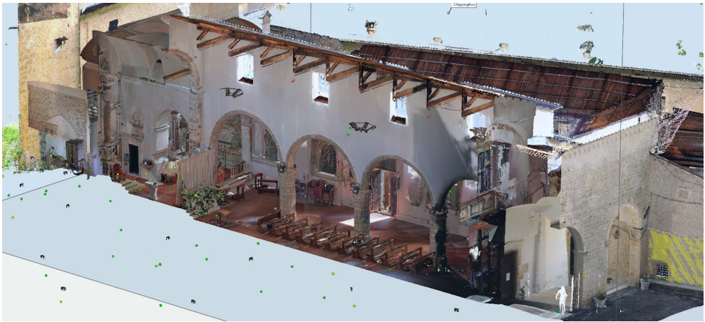
Fig. 3 Surfing between raw data.

analogue resources” (Art.1). Unlike Stone’s (1999) definition of “Virtual Heritage” – i.e. “the utilization of technology for interpretation, conservation and preservation of Natural, Cultural and World Heritage” –, in the Charter the Digital Heritage tends to assume an independent connotation and value. Focusing on digital heritage from real contents, the digital objects assume a new meaning of “real”, “but conceptually this meaning derives from the active relationship with the physical content, from which it derives. In this kind of digital heritage, there is not visualization without a prior reality and, in a philological study of a digital model, we cannot forget its real reference from whom it is born. Therefore, the issues related to data and information grow to include the relationship with