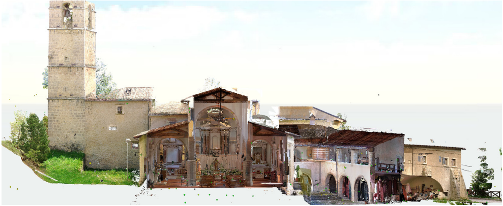
Fig. 2 Exploring the point cloud.