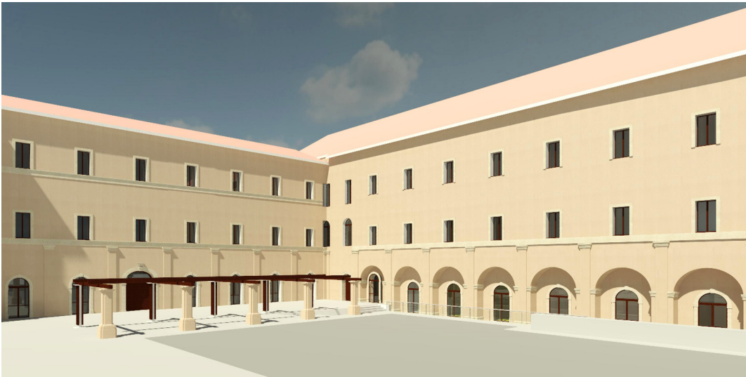
Fig. 4 Palazzo Camponeschi in L'Aquila (IT). The 3D model.

the position of the 'human dimension', considered more and more a key element. Heritage professionals necessities are better taken into consideration, from digital projects early stages; end users, such as visitors of museums, tends to be involved in some cases during the planning phase. The 'wow' effect of ICT technologies for heritage researchers, practitioners and curators is now diminishing, while the sustainability of digital projects and their effectiveness as referred to a specific goal, in constantly increasing. The role of design and co-creation is emerging [...], filling the gap among audience,