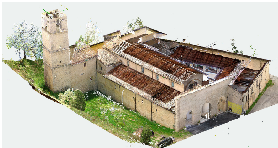
Fig. 1 S. Giovanni Battista Convent in Lucoli (IT). Digitalization of the architectural complex.

but today digital technologies profoundly influence it (Mitchell, 2017. Purgar, 2017). It is the “pictorial turn” (Mitchell, 1994) that does not oppose a visual paradigm to a verbal one, but considers their semiotics in a substantial way. There is a change of perspective in the visual disciplines according to a re-thinking of the post-modern “linguistic turn”: an “iconological” parallel reading of “images” and “logos”, in a non-conflictual interpretation but in a cohabitation (Mitchell, 1986) of “mixed media”.