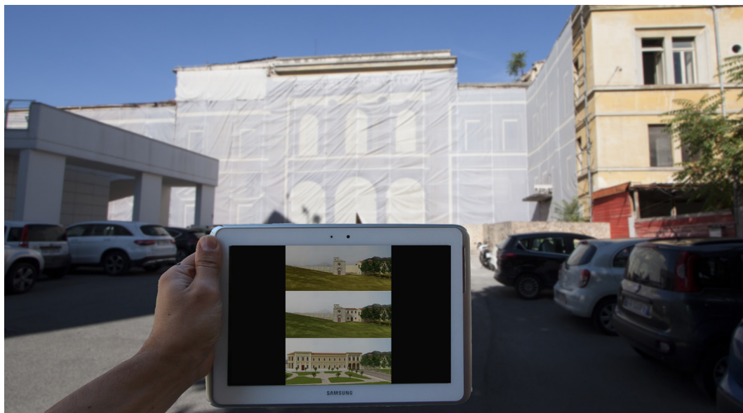
Fig. 6 San Basilio Square in L'Aquila (IT). Visualizing the historical reconstructions in Augmented Reality.

The reflection on the concept of “Meta-Model” combines with the potential offered by Augmented Reality applications offered by ICT: through visual devices, information is superimposed in transparency on reality, that is on the direct vision of the observer, in the moment of the experience itself. There is no deception: the observer has clear that the digital image is different from the material world, it is information that accompanies the “Physicality”. An addition, an informative enrichment, but in the absolute ontological respect of the Reality itself. There is no contact, the Reality is not altered in its materiality, but in its mediated through the image. The concept of avatar changes: the user does not alienate himself in another-self within a synthetic environment, his feelings are not artificially produced as in VR. The user interacts with the real world: it is not correct to say that the user becomes the concept of avatar of himself but rather the avatar no longer makes sense to be. On the contrary, in a certain sense, there are the avatars of the physical objects, that is they are partially virtualized through AR visualizations, but in the sense of Lévy (1995): they acquire a “poten-